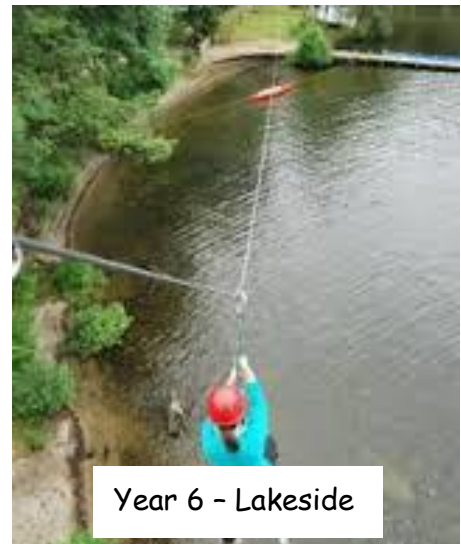
Year 6 - Lakeside