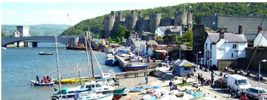
Year 5 - Conwy