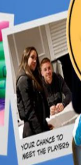
YOUR CHANCE TO MEET THE PLAYERS