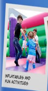
INFLATABLES AND FUN ACTIVITIES